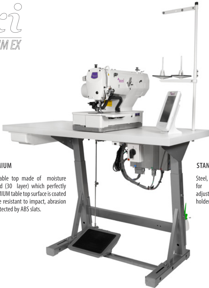
TABLE TOP TO PREMIUM

The highest quality table top made of moisture resistant birch plywood (30 layer) which perfectly damps vibrations. PREMIUM table top surface is coated with a special laminate resistant to impact, abrasion and splinters. Sides protected by ABS slats.